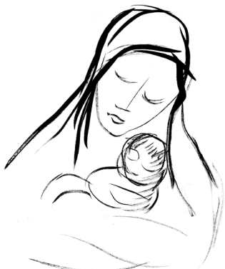
Drawing by Thomas Merton.

Mother Seton House PO Box 673 Fryeburg, ME 04037